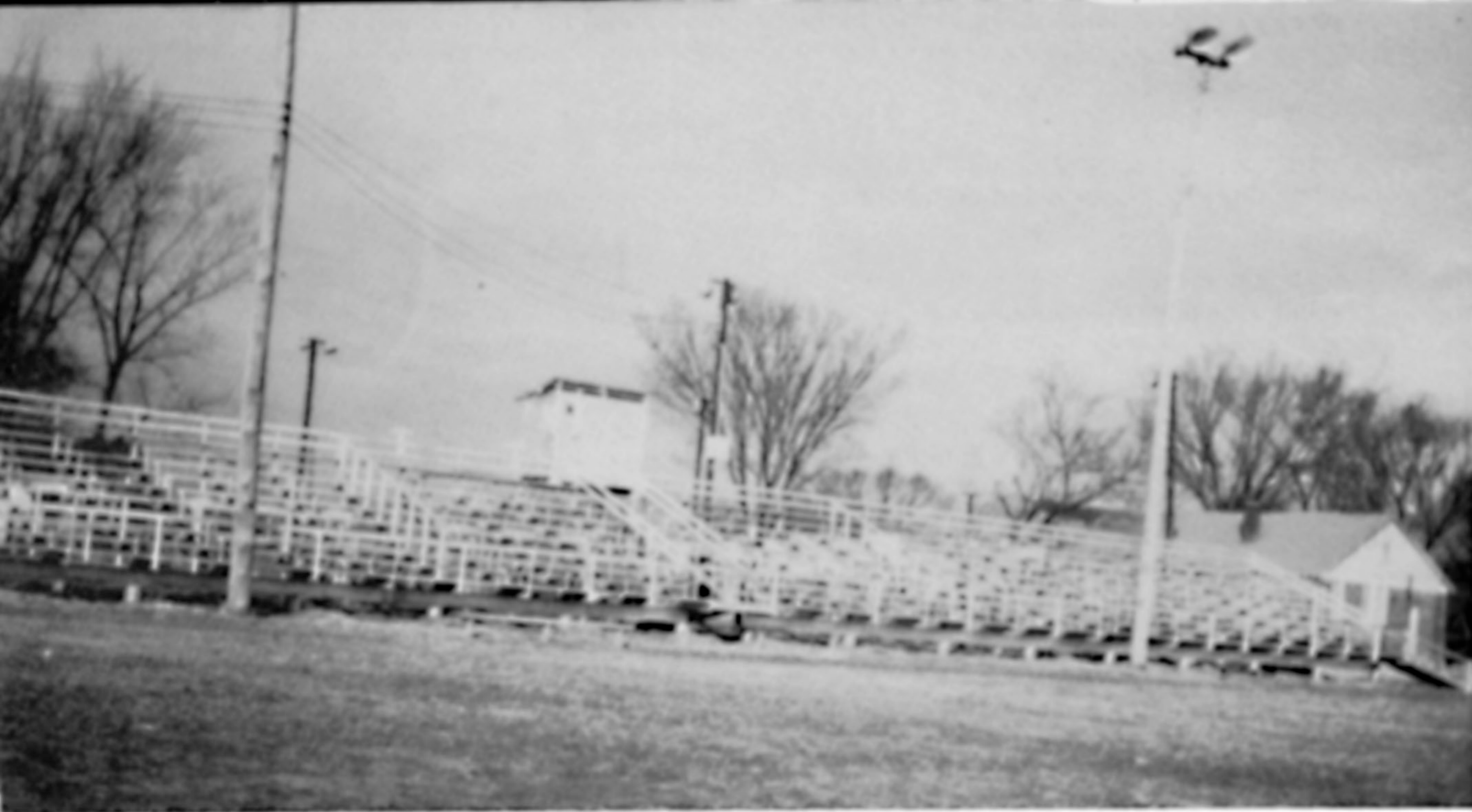
OUR NEW BLEACHERS