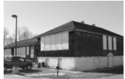
Kennard High School