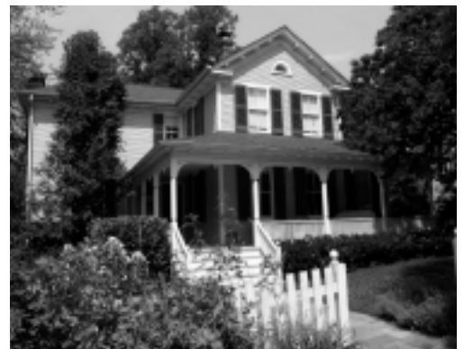
Somerset Historic District