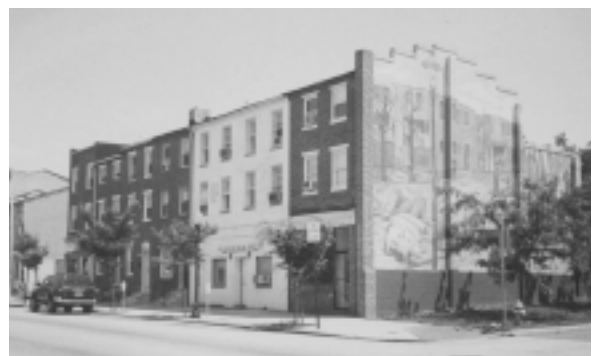
Pigtown Historic District