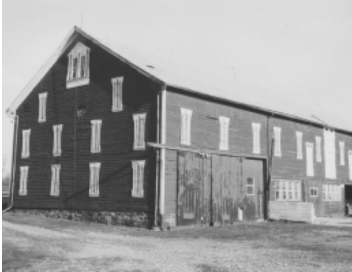
Winemiller Family Farm

The National Register of Historic Places is a federal program designed to recognize properties significant in American history and culture. During 2006, nineteen proposals to nominate Maryland properties to the National Register were reviewed by the Governor's Consulting Committee. Twenty-nine nominations comprising a total of over 6,000 contributing resources were forwarded to the National Park Service.