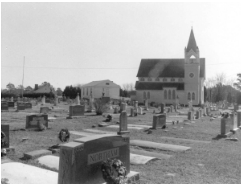
Deal Island Historic District

For more information on these listings please visit http://www.marylandhistoricaltrust.net/nr/index.html