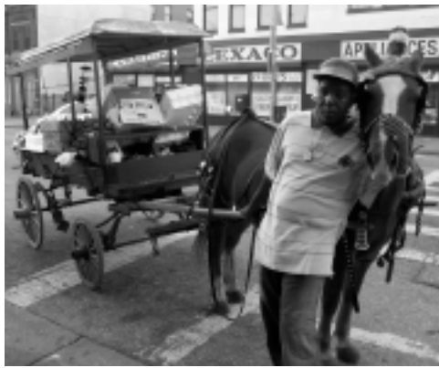
A Baltimore City arabber wagon