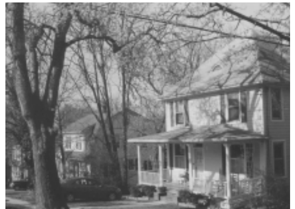
Linthicum Heights Historic District