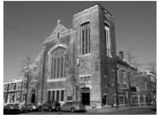
Jones Tabernacle Baptist Church

Awarded a $500 grant to the Town of Somerset for the design, fabrication, and installation of six signs identifying the boundaries of the Somerset Historic District. Somerset is a streetcar suburb in Montgomery County with a local historic district whose boundaries are a source of confusion for residents.