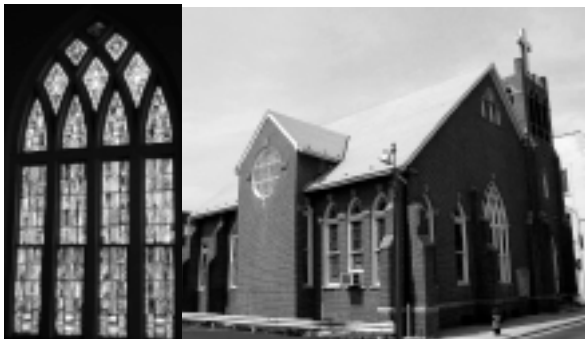
Center United Methodist Church

Awarded a $2,500 grant to The Friends of Dudley's Chapel to help restore the interior finishes of Dudley's Chapel, a 1783 Methodist Meetinghouse where Thomas Coke and Francis Asbury, the first American Methodist bishops, preached. Dudley's Chapel, which is listed on the National Register, was the first Methodist Meetinghouse in Queen Anne's County.