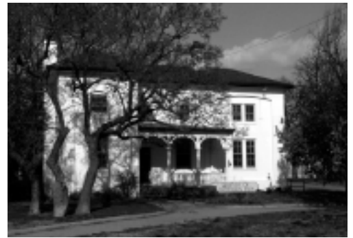
Patterson Park Superintendent's House